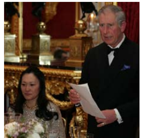
Below: HRH The Prince of Wales delivers his speech at the YBI annual dinner

Earlier in the day the two organisations, YBI and PlaNet Finance, signed a cooperation agreement focusing on three areas: in-country partnership, resource-raising and advocacy.