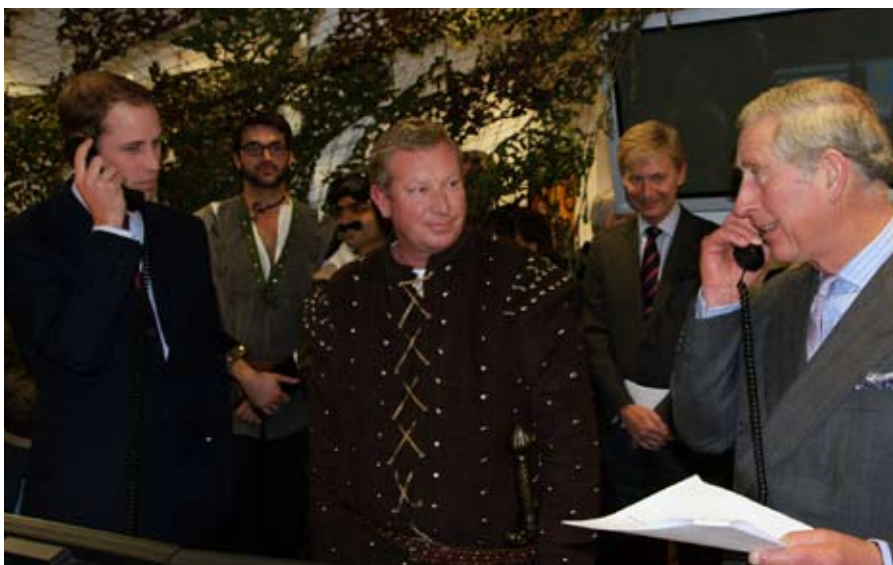
Above: The Prince of Wales and his son Prince William closing deals as part of the ICAP Charity Day

Following a very competitive concept note round, over 100 civil society organisations were invited to submit their full offers for consideration and only 39 were finally approved. PPA's were